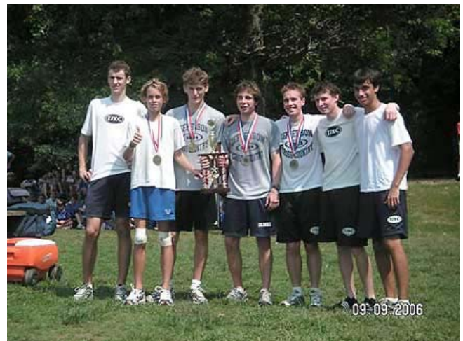
First Place Varsity Boys XC Team

great way to experience TJ, meet new people, and see that there is more to TJ than just science and tech. The Homecoming football game is October 20 and our last home game (against Woodson) is November 10.