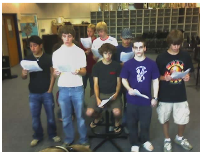
2006 Participants of the men's ensemble work on new music at choir boot camp.