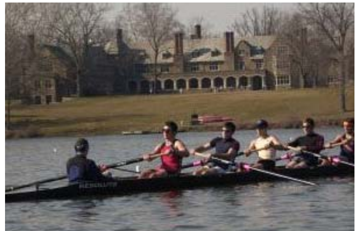
The men's varsity eight warms up for its race at the St Andrew's Regatta in Middleton, DE