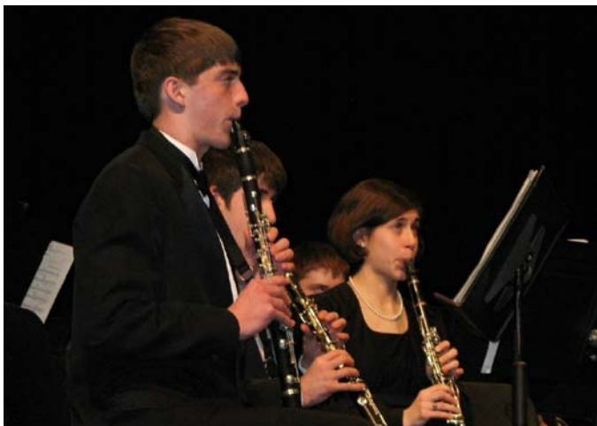
District XI Band Festival

Chantilly Jazz Festival: In March, Jazz I performed in this festival described as "the premier scholastic jazz competition on the entire East