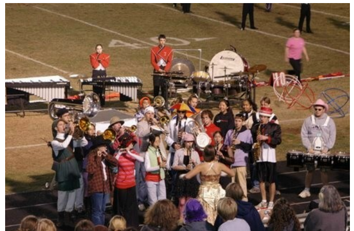
All Things Band Night