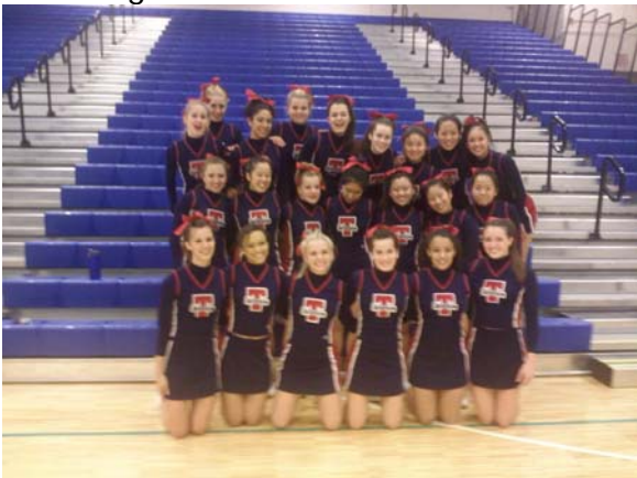
The Varsity Cheerleaders

Varsity Cheer: The squad had two excellent performances at the Homecoming Pep Rallies. They competed on October 15 in the Northern Region cheerleading competition for Liberty District and did very well; and competed on October 20 at the Liberty District finals at South Lakes High School.