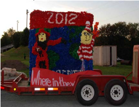
Freshman class at Homecoming

The freshman class float at the Homecoming game on October 10, 2008