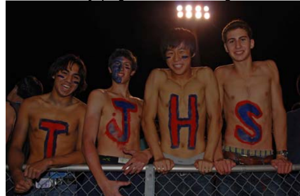
Class 2010 enjoying the Homecoming Games

The Class appreciates the support of parents for Homecoming – thank you to those who chaperoned, shared their home for float building, drove the float at the football game and helped with other activities.