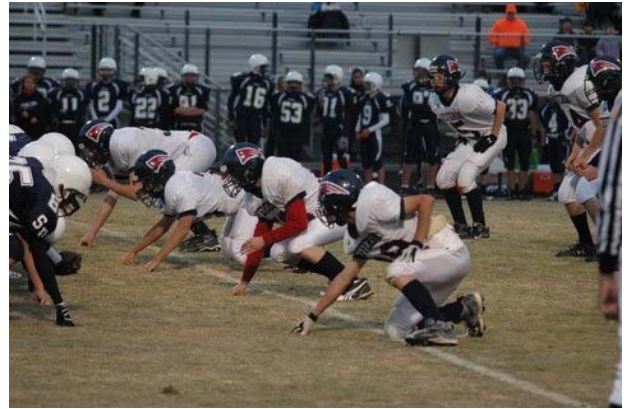
Freshman Colonials vs. Stone Bridge Bulldogs

actually beat Stone Bridge? What motivation a win would be for both the JV and Varsity Teams!