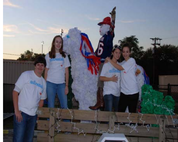
Class 2011 enjoying the Homecoming Games

input of ideas and time will certainly make a difference!