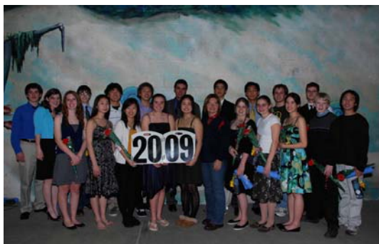
TJ Swim and Dive seniors 2009