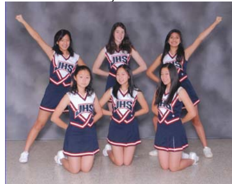
The JV squad may be small in number but they are big in SPIRIT!