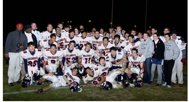
Colonials celebrate win over South Lakes, make playoffs!!!

After wins against Falls Church and Marshall, the team spoiled Homecoming for the McLean Highlanders, making a huge comeback in the fourth quarter to top McLean 28-23.