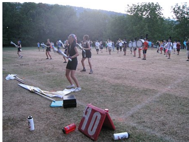
Thomas Jefferson Marching Colonials (TJMC) camp at Orkney Springs, Virginia