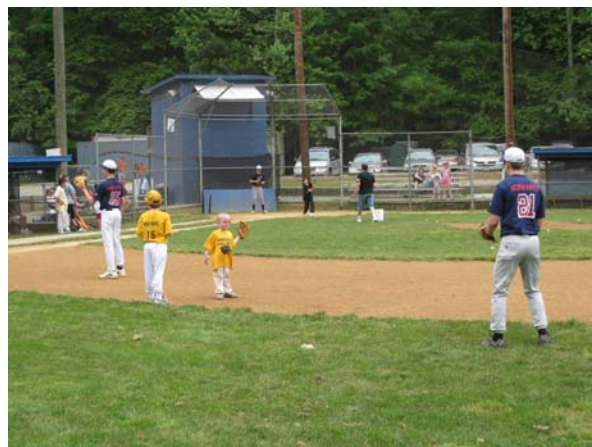
TJ JV Baseball Players Volunteer with the Springfield Challenger Little League Program

At the close of the season, some of the players volunteered with the Springfield Challenger Little League, assisting youngsters who have special needs. It was rewarding for all.