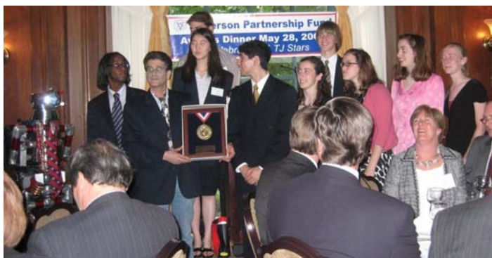
Sprocket, the robot (left), stands with TJ students and Dean Kamen at the annual awards dinner.