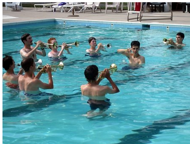
TJMC Trumpets in the water