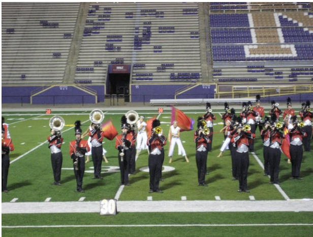
TJMC Parade of Champions, James Madison University. TJMC is Grand Champion!