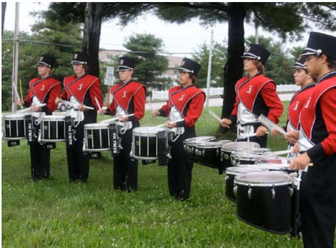
Thomas Jefferson Marching Colonials, staying dry at their first competition in Westminster, Maryland on September 12.

Much gratitude to all the chaperones who turned out in the rain. Comic relief came in the form of two FCPS buses tied together with rope and covered in tarp to keep the instruments as dry as possible.