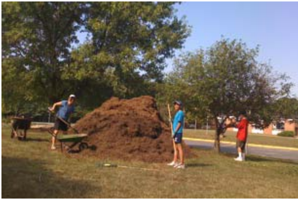
Landscape Committee members tackle an enormous pile of mulch.

Please contact Eleni Silverman at eleni1_at_cox.net if you would like to join in the fun.