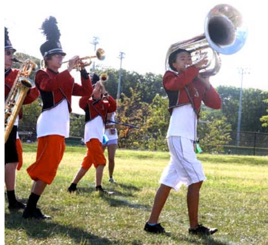
Thomas Jefferson Marching Colonials at their very first show: a preview at TJ on September 1.

Marching Colonials: Thomas Jefferson Marching Colonials is off to a pounding start. In late August, the band and color guard students returned from an exciting, albeit exhausting, practice week at Shrine Mount in Orkney Springs, a secluded mountain retreat nestled deep in rustic Shenandoah Valley. A colossal thanks to the many parent volunteers who chaperoned band camp and the social activities upon return just before school started up.