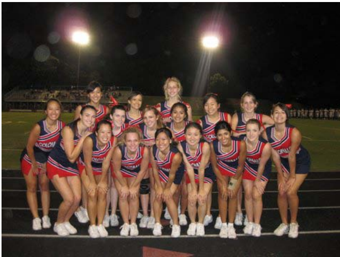
The Varsity squad sporting their new uniforms.