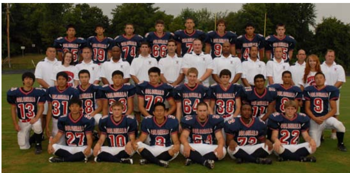
2009 Varsity Football Team

Progress on the field is inevitable as their experience grows. After an upcoming trip to 13th-ranked Stone Bridge in Loudon County, the team looks forward to a very competitive Homecoming game against Washington-Lee from Arlington. Come cheer on YOUR TJ Colonials!!