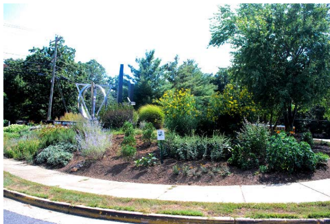
Monarch Waystation Garden