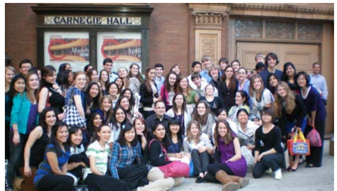
TJ Chorus Performs at NYC Carnegie Hall