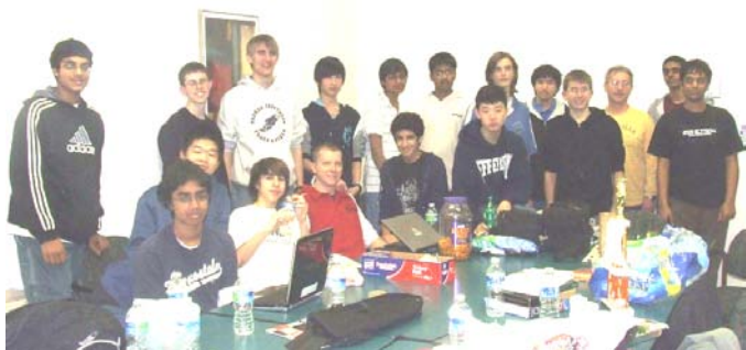
TJ Chess team at the State Chess Tournament