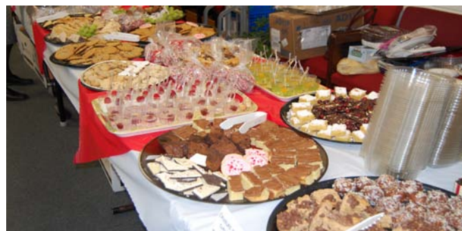
A fabulous array of lunch treats.