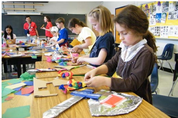
Shakespeareance participants making props for their performance.

TJ Drama proudly presents Once in a Lifetime by Moss Hart and George S. Kaufman, Friday and Saturday, April 16 and 17 at 7:00 p.m. What happens in a time-honored industry when new technology changes the rules? When that industry is the motion picture business, and the innovation is sound movies, the answer is a Once in a Lifetime opportunity for hilarious entertainment! Tickets will be on sale at the door.