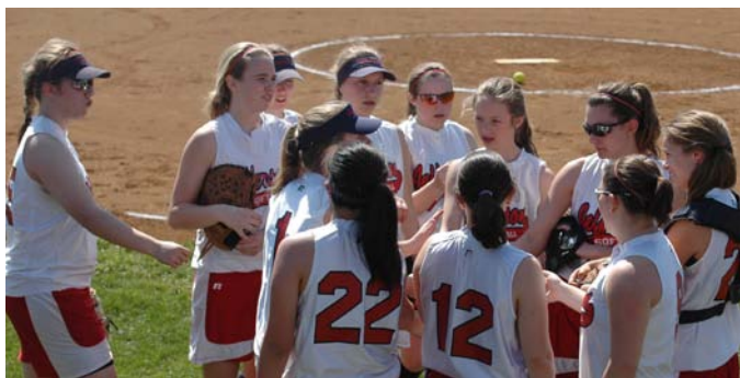
The team huddles during the Herndon game.