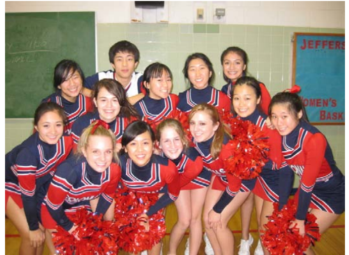
"We are the mighty Varsity"