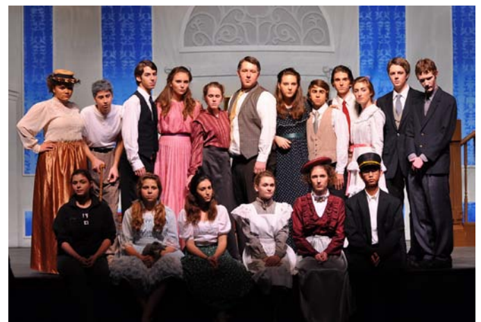
The "Meet Me in St. Louis" cast