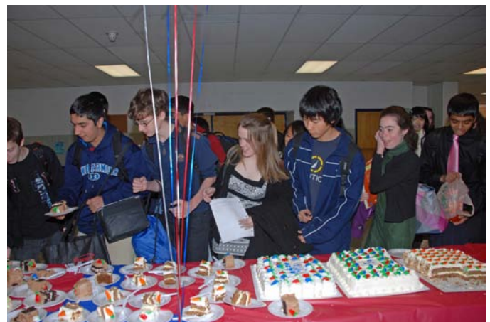
The PTSA serves students, faculty and staff 50 cakes during lunch to celebrate TJ's No. 1 ranking