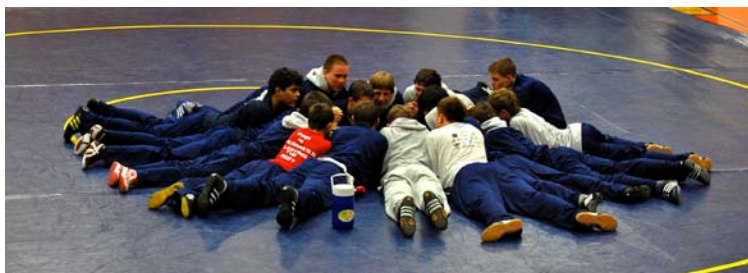
TJ wrestlers plan their strategy before taking to the mats in North Stafford

Please come support the team at our two home meets in January!! We host Herndon on January 20 and Wakefield on January 27. You may see some exciting matches, as our wrestlers strive to pin their opponents in dramatic finishes!