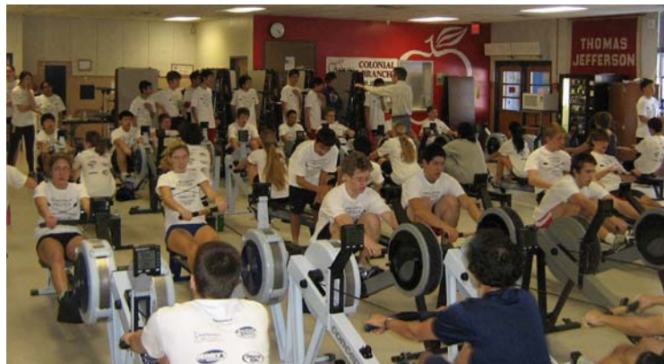
TJ Crew Ergathon

meters to raise funds for the team and to make a donation to the Central Asia Institute for the building of schools in Afghanistan and Pakistan (as profiled in the book Three Cups of Tea ). The team wishes to thank its corporate sponsors, Jerry's Ford, Reston Shirts, Concept 2, Smoothie King, IndAroma and JLRowing for their generous support. And thanks to all our friends and families for your donations!