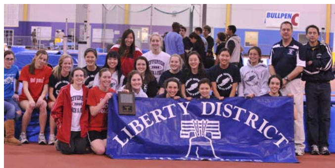
Liberty District Indoor Track Champs 2010