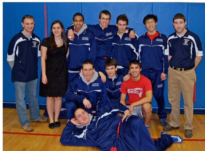
Wrestling Seniors and Coaches celebrate Senior Night