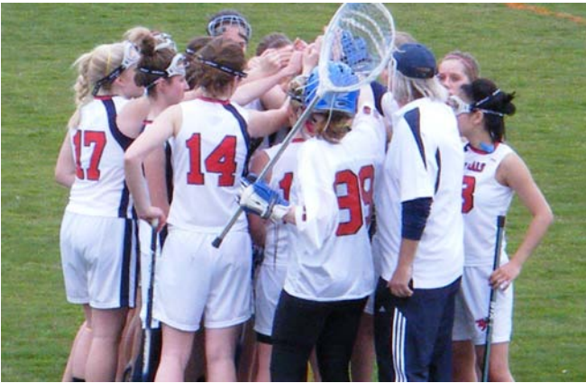
Girls Varsity Lacrosse huddle up before the game.