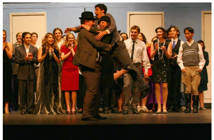
Once in a Lifetime cast enjoys the curtain call