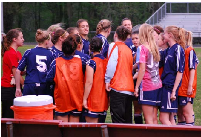
Varsity girls get pumped up in pregame huddle