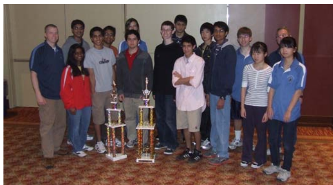
Chess Team at Nationals