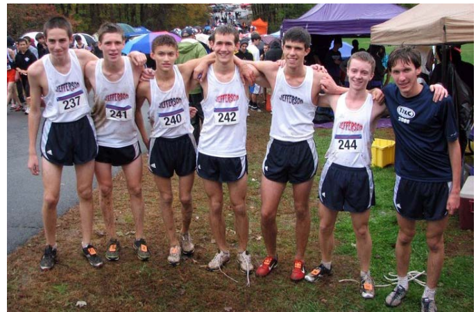
TJ Boys Varsity at Regionals