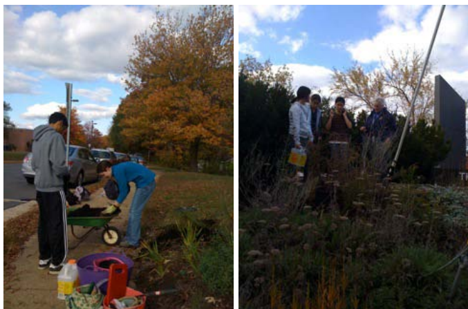
Cultivators of the Earth Club mulching the beds and planting in the Water Wise Garden.

Mr. La Fever gave the 'Cultivators of the Earth Club' a presentation on how we might map the TJ gardens using ARC View; if anyone is interested in participating in this effort please contact Eleni Silverman at eleni at cox.net .