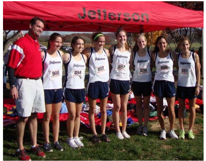
TJ Girls Varsity at States