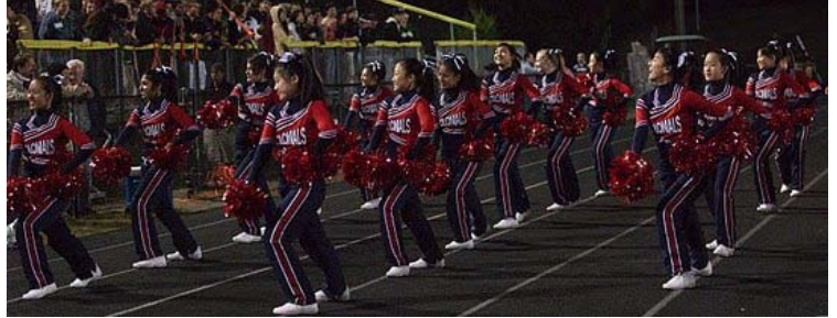
A packed stadium and spirited TJ fans cheer the Colonials to victory!