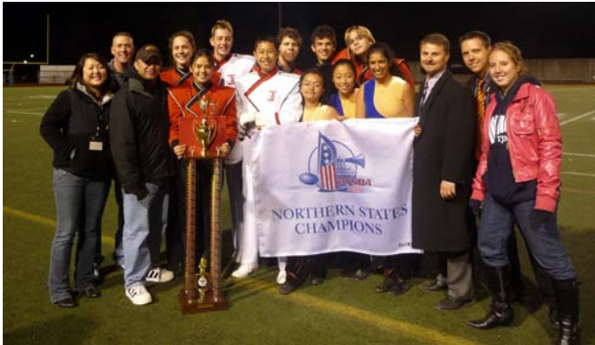
The Marching Colonials receiving their trophy in Allentown on Halloween.

3 rd respectively). Also represented in this competition were bands from NY, CT, DE, MA, and VA.