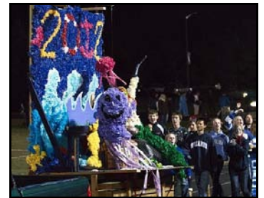
The Colonials end the night with a 27-20 win over Marshall.