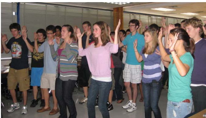
Students enjoy learning traditional German dances.

About 100 students enjoyed the German Honor Society’s celebration of Oktoberfest on September 29. Students learned the traditions of this Munich holiday, which was 200 years old this year. German Honor Society students prepared the Bratwurst and other treats, and led the participants in German Schuhplattler dances and in Oktoberfest songs.