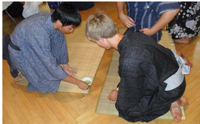
Students share their cultures as part of the High School Diplomats program.