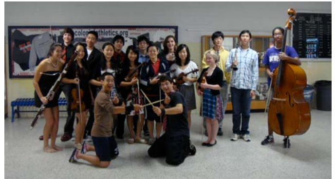
TJ Orchestra and Band Students Selected for Northern Virginia Senior Regional Orchestra 2010