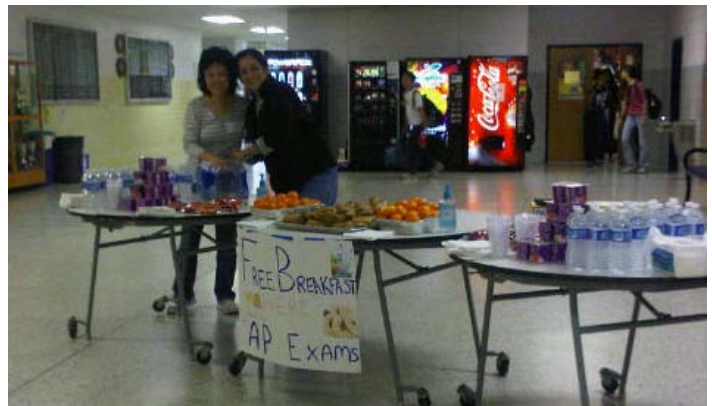
The PTSA provided a healthy breakfast snack for students taking the AP Exams.