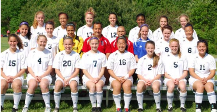
Girls varsity soccer team