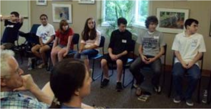
TJ students share their experiences with incoming freshmen and their families.

2012 Science Fair – Act Now to Ensure Compliance with Competition Project Requirements!: Students who plan to do research this summer- at TJ, or at a research institution, or at home- should remember that their work could result in a science fair entry, or in a Siemens or Intel Science Competition project. Because those projects have strict requirements for documentation, students must have the proper forms from the beginning! See page 21 below, in the “Announcements” section, for more details.