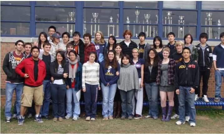
TJ Orchestra Seniors