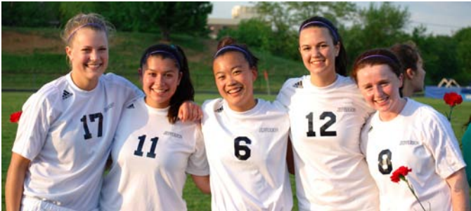
Girls varsity soccer seniors