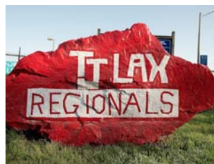
The Rock says it all – boys lacrosse!

The Colonials finished their season in the first round of the Regional Tournament at Annandale. In a hard fought effort dedicated to the 12 seniors on the team, TJ lost to the incredibly talented Atoms!