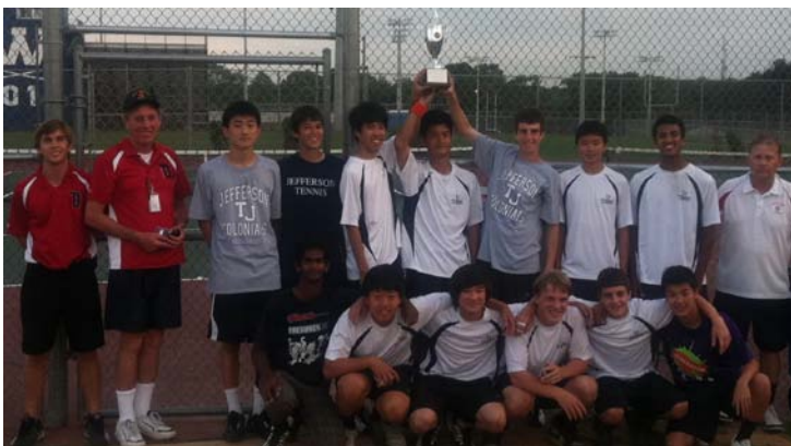
Boys tennis with their third straight Northern Region team championship trophy.

On May 25, the team defeated Westfield, McLean and Langley, winning its third straight Northern Region team championship. Congratulations, everyone, and good luck at States!