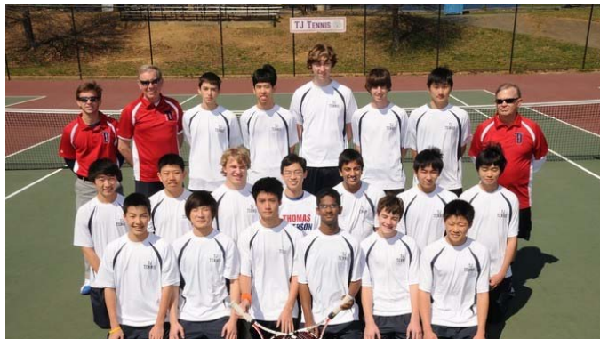
TJ Varsity Tennis Team