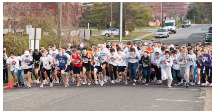
Runners at the start of the Inaugural TJ PiMiler.