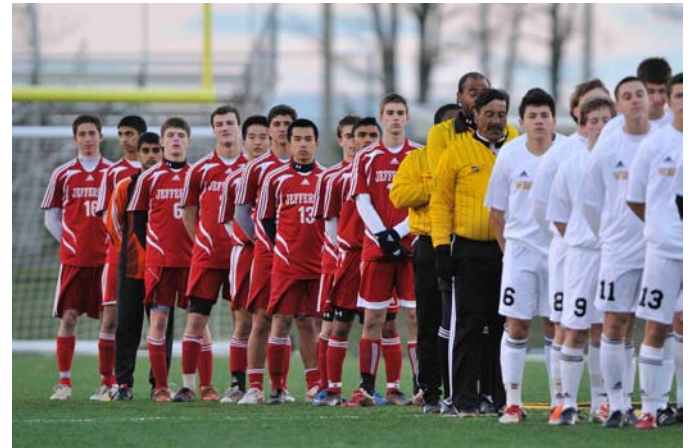
TJ Varsity Soccer team