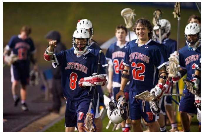
The varsity boys lacrosse team is all smiles after defeating Fairfax.