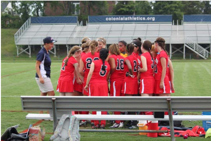
The JV Field Hockey Team huddles before their scrimmage against Lee High School.