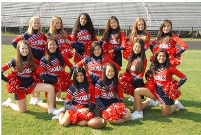
TJ Varsity Cheer Team