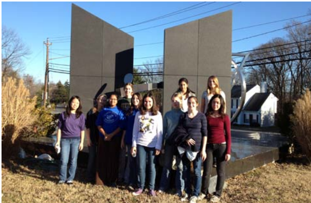
Members of the Greenhouse Club

Landscapers will be indoors during the month of February, but we will need all hands in March as we get the gardens ready for Spring Bloom. Watch for our bulletins in Tech cetera and on our web page.