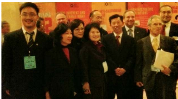
Victor Shen and CAPAVA members pose with Virginia Lieutenant Governor Bill Bolling and former Governor Tim Kaine at the Forum.

U.S. Senate passed Resolution 201 on October 7, 2011, expressing regret for the passage of the Chinese Exclusion Laws.