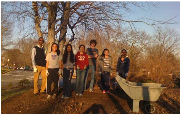
Some student members of the Cultivators of the Earth Club