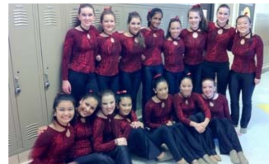
Varsity Dance Team