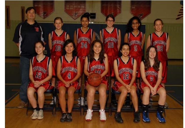
Girls Freshman Basketball Team

A decisive victory in a scrimmage at Dominion and a regular season win against Stuart have the girls off to a great start. The girls are looking forward to the challenges that face them in the Liberty District in 2012.