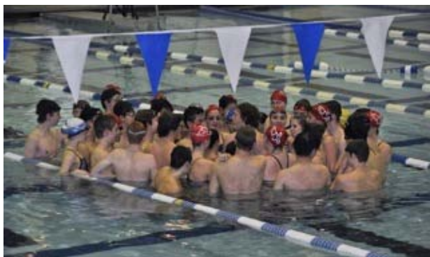
Swim and Dive Teams huddle for a team cheer.

our season continues on January 6, with a meet against South Lakes High School.