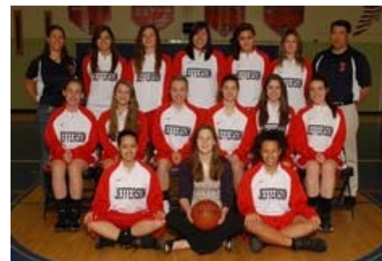
Girls Varsity Basketball Team

Girls Varsity Basketball: The Girls Varsity Basketball team has gotten off to a very busy start! For example, they participated in the Arthur Turner Memorial Tip Off Tournament in early December. In addition to their regular season games, during the holiday break in the last week of December, the team participated in the Pohanka Chantilly Classic Basketball Tournament.