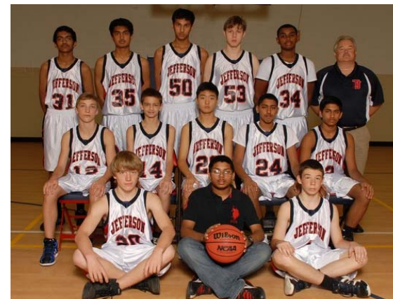
Boys Freshman Basketball Team

focus shown by the team in the first half was a large improvement from the previous game. We look forward to a great fun-filled basketball season.