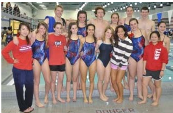
Swim and Dive Teams Seniors