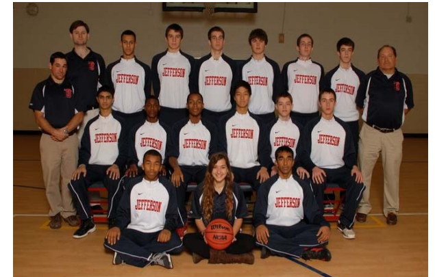
Boys Varsity Basketball Team

We encourage you to come watch a game! Not only is the action on the court exciting, but the enthusiastic students in the stands keep you smiling long after the game has ended.