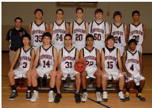
Boys JV Basketball Team

The team is in good shape, and the spirit in them is tangible as they show maturity and cohesiveness while playing this early in the season.